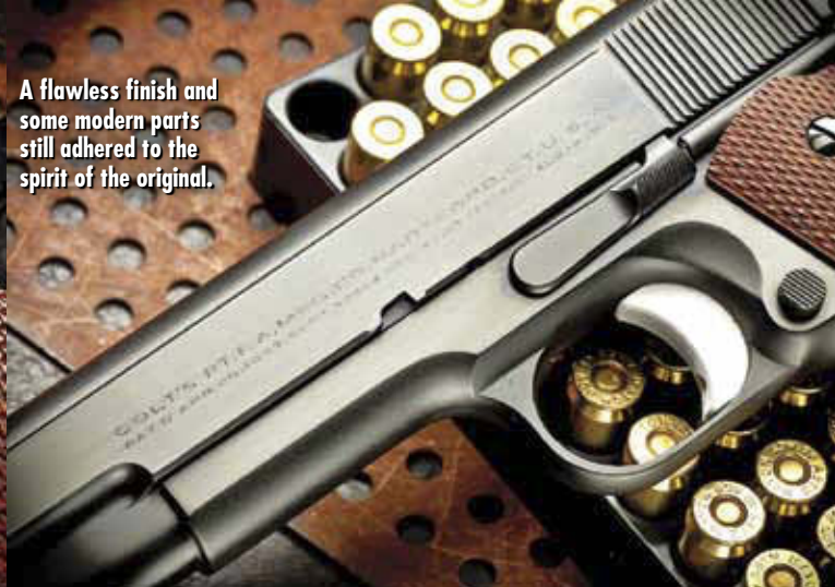
A flawless finish and some modern parts still adhered to the spirit of the original.