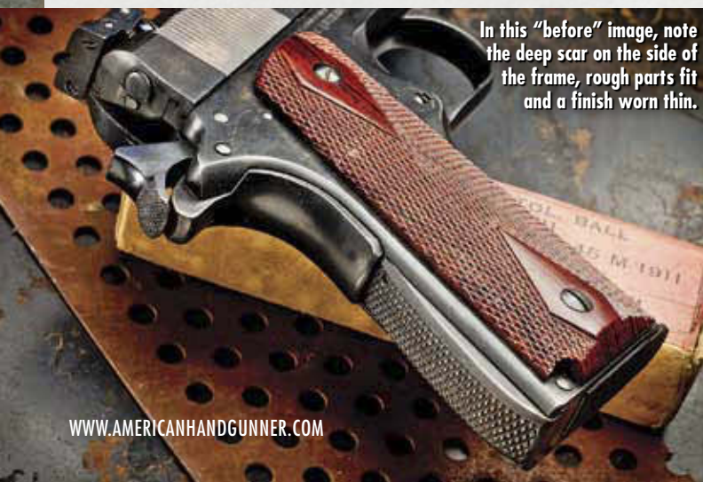
In this “before” image, note the deep scar on the side of the frame, rough parts fit and a finish worn thin.